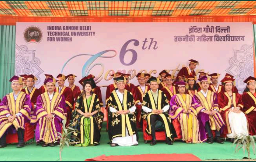
6TH CONVOCAION OF IGDTUW

AT INDIRA GANDHI DELHI TECHNICAL UNIVERSITY FOR WOMEN (IGDTUW), OUR DYNAMIC SPORTS EVENTS ENCOURAGE PHYSICAL FITNESS AND TEAMWORK.